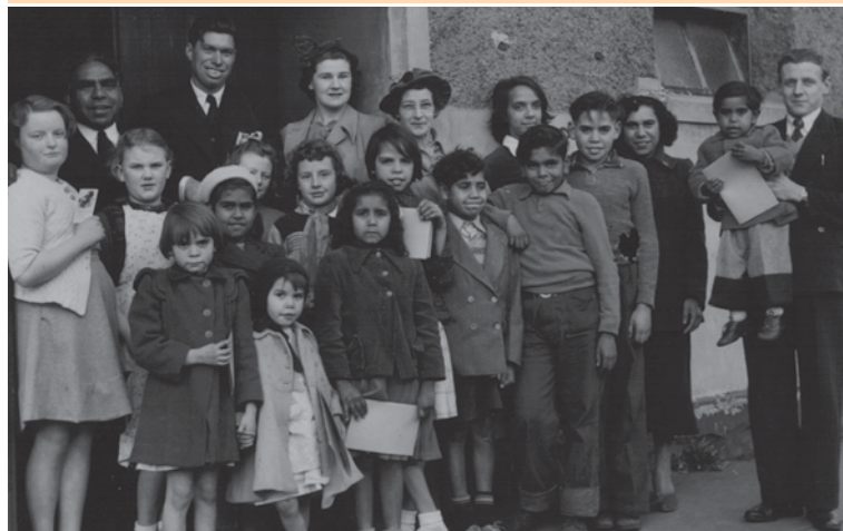
PASTOR DOUG NICHOLLS AND CONGREGATION, CHURCH OF CHRIST, GORE STREET, FITZROY 16